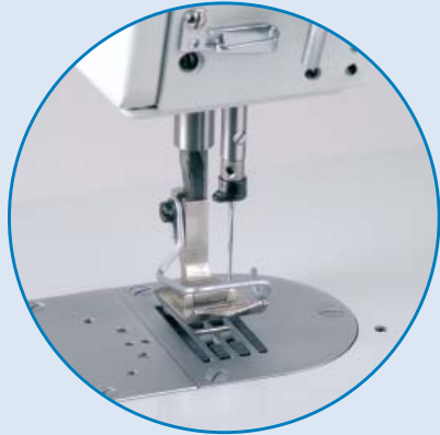
4-Row feed dog for positive fabric control