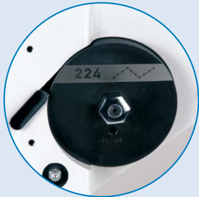
Easily inter-changeable cams